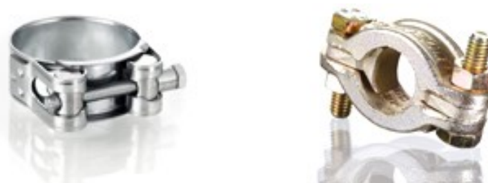
Fig. 3. Metal clamps for rubber hoses - examples

18. The use of rubber hoses with visible defects (soft spots, bulges or blisters, kinks or permanent deformation of the hose from its original form) or with service life expired is prohibited;