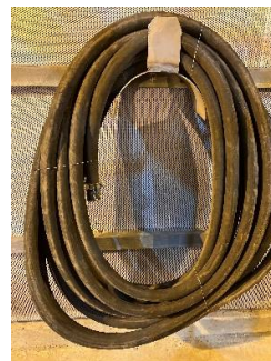
Fig. 1. Fittings used for the storage of rubber hoses - examples

11. Hoses must be stored protected against any contact which may result in cuts, scratches or cracks and contact with chemicals such as solvents, fuels, lubes, greases or volatile substances.