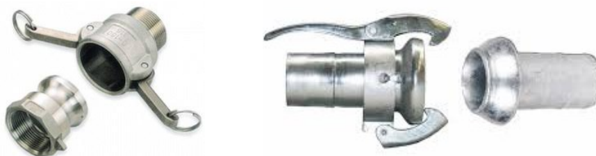
Fig. 2. Rubber hose mating couplings - examples

17. Rubber hoses must be protected against kinking. Bending angle cannot exceed minimum bending radius specified by the manufacturer as otherwise this may result in the deformation of the hose. It is prohibited to place rubber hoses on sharp edges, hot surfaces, power cables.